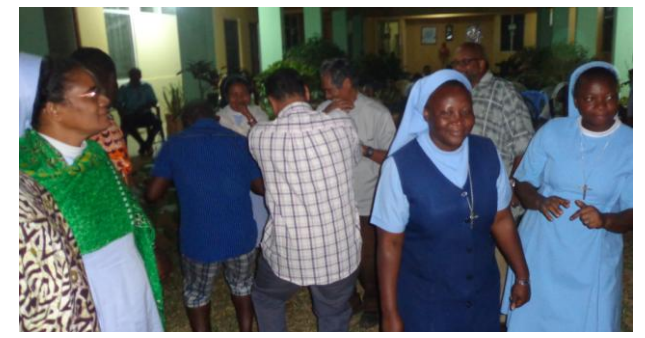
The free-style dancing competition

acapella group, jokes and a number of interesting stories and tales which took everyone deep into the night without realising it.