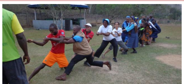
The teams doing the 'tug of peace'.

After the games, the confreres and sisters gathered for a solemn vespers projected on power point in the novitiate chapel. A sumptuous dinner was prepared to console the weak and exhausted bodies. For the evening relaxation, there was a line up of displays and performances by SVD and SSpS novices, the SSpS postulants, individuals or groups of confreres and sisters in the inner court of the novitiate. The performances included various choreographies, novitiate