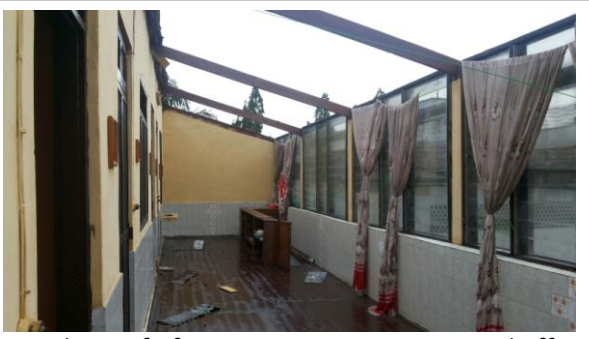
The roof of sitting room upstairs ripped off

Our Lady of Good Counsel Parish, Kwahu Tafo was affected by a rain storm. Some roofs in the mission were ripped off. See the images. The confreres are happy to receive your donations of roofing sheets and funds to restore the structure.