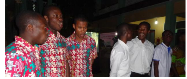
The acapella group performing