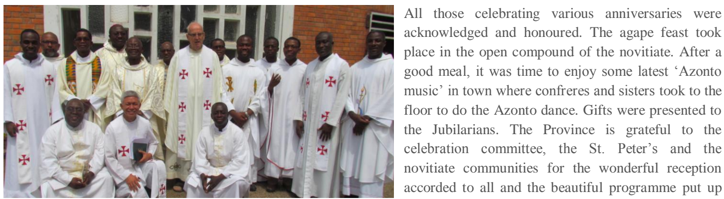
Group photo with concelebrants