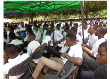
A section of the students

He expressed his pride of the many former students of St. Paul who are holding various important positions in the country. Later on, an imposing statue of St. Paul was unveiled and blessed by the Bishop.