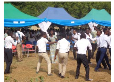
A section of the students dancing