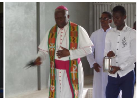
The Bishop blessing the workshop