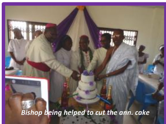
Bishop being helped to cut the ann. cake