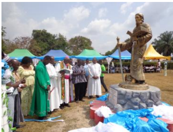
Blessing of the unveiled statue