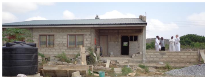
Progress of the construction to complete phase 1

From Easter, the centre would be opened for day recollections, workshops etc. Do let your faithful know.