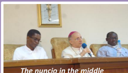
The nuncio in the middle