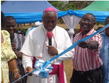
The Bishop cutting the tape to unveil the statue