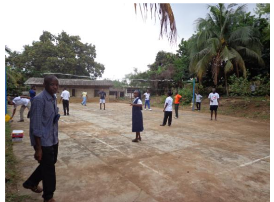
SSpS versus SVD at the volley court

Please send your stories from the districts by 25 th March. svdghanacom@yahoo.com Visit: www.svdghana.org