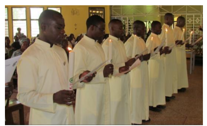
The 9 professing their vows

Nine seminarians at the Common Formation Centre (CFC), Tamale of the Society of the Divine Word, Ghana Province have professed their perpetual vows. The event which took place at the Carmelite Chapel makes these young men fully professed religious and full members of the Society of the Divine Word.