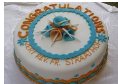
The appreciation cake