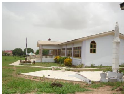
The conference Hall

The Religious Congregations present were HDR, SSPS, SNND, ST JOHN OF GOD, SVD.