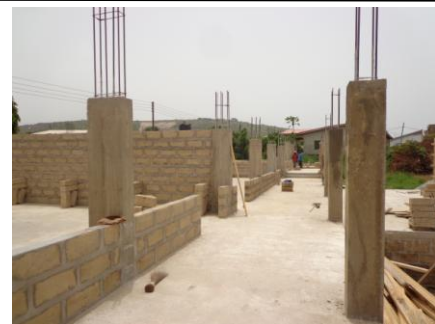
Dining Hall, Kitchen & stores