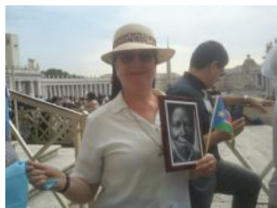
St. Veronika, SSpS