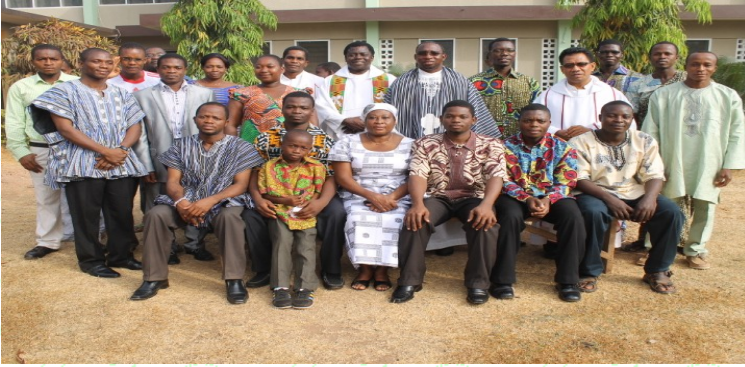
The Novitiate Community pose with the Friends of the Novitiate.

This year the community went agog when we celebrated the Cultural Day from Sunday, 8th to Monday, 9th January 2012. The day also coincided with the solemnity of the Baptism of Jesus Christ. This was the second of its kind. The Novice Directors instituted the cultural day last year to promote our diverse cultures. The theme for this year's celebration was taken from the SVD 17 th General Chapter: From Every Nation, People and Language: Sharing Intercultural Life and Mission.