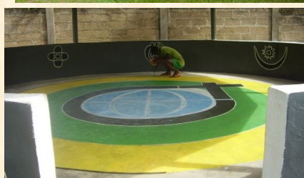
The inside view

Last year when the community planned to put up a Jubilee hut, all of us brought our different gifts and talents on board to make it a reality. Work started in December last year and has been completed. The first mass was celebrated on the 21st of April this year to thank God. Earlier, the Provincial Council had its March meeting here.