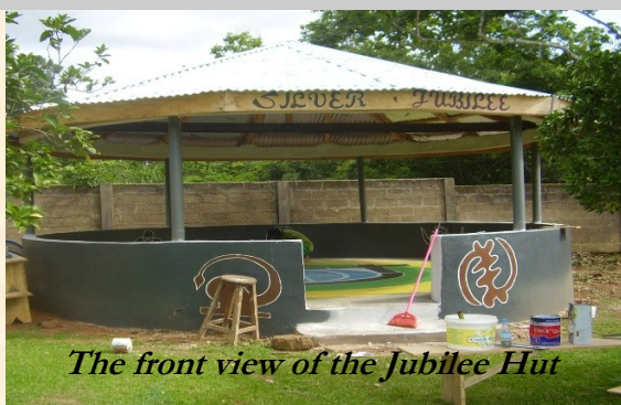
The front view of the Jubilee Hut